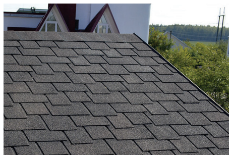
Katepal Shingles shown on a house in Finland.