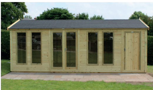
Katepal Shingles shown on an Olympian Garden Building.